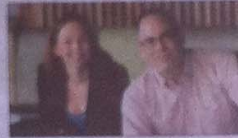
Teaching Advantage Team QUT Business School, Leadership, Learning and teaching, Client focus, Influence on work culture or climate, Partnerships and engagement