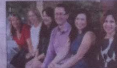
Palliative Care Workforce Development Team Health, Institute of Health and Biomedical Innovation, Leadership, Learning and teaching, Partnerships and engagement, Client focus, Influence on work culture or climate