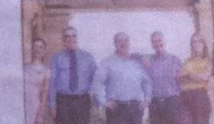
Power of Engineering Inc. Foundation Team Administrative Services, Science and Engineering, AECOM, Leadership, Learning and teaching, Partnerships and engagement, Client focus, Influence on work culture or climate