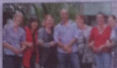
Medical Imaging Training Immersive Environment Health, Leadership, Learning and teaching, Partnerships and engagement, Client focus, Influence on work culture or climate