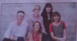
Jiangsu International Foundation for Education Excellence teaching team Education, Leadership, Learning and teaching, Partnerships and engagement