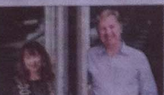
Creative Advertising Team Creative Industries, Leadership, Learning and teaching, Partnerships and engagement