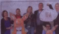
Out of the Box Children's Festival Creative Industries, Education, QIPIC, Leadership, Learning and teaching, Partnerships and engagement, Client focus, Influence on work culture or climate