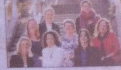
Continuing Professional Education Team Research and Commercialisation, Client focus, Influence on work culture or climate, Partnerships and engagement